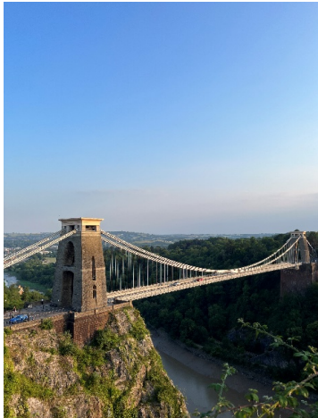
Clifton Suspension Bridge

Some notable public spaces I highly recommend are the St. Nicholas Market which runs every Saturday, Clifton Downs and the Clifton Suspension Bridge for picnics or walks with friends, Cabot Circus which is the local mall, and Harbourside, all of which are easily accessible by walking or taking the bus.