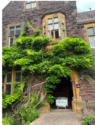
One of the residence buildings in the University of Bristol Botanic Gardens

became very close friends with. Others who lived outside accommodation found it difficult to make friends sometimes.